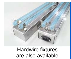
Hardwire fixtures are also available