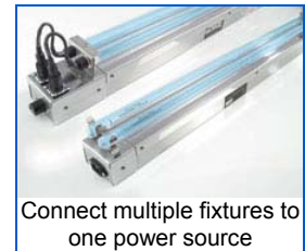
Connect multiple fixtures to one power source