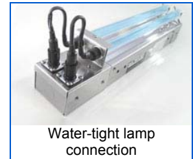
Water-tight lamp connection

FIXTURE: Housings are constructed of heavy gauge hospital grade stainless steel. Reflectors are fabricated from the highest grade bright annealed polished stainless steel, which has a reflectivity rate of 88% when exposed to short-wave UVC in the range of 254 nm. All components are in one integrated assembly to maximize serviceability.